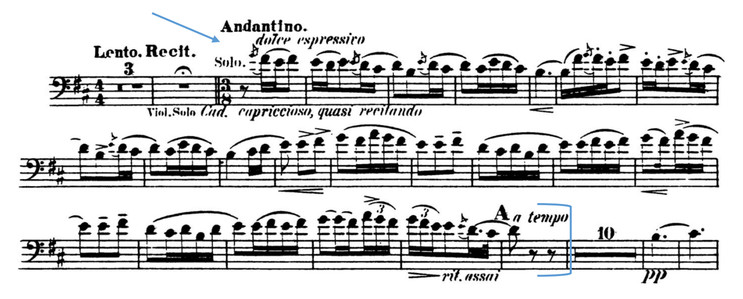
• Excerpt #2: