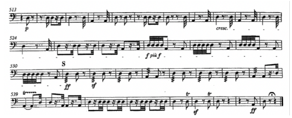
STRAVINSKY: LE SACRE DU PRINTEMPS - REH. #189 TO END

BEETHOVEN: SYMPHONY NO. 9, MVT I - MEASURE #513 TO END OF MOVEMENT